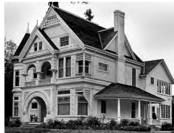
Ardenwood was named after a forest area described in Shakespeare's play "As You Like It."