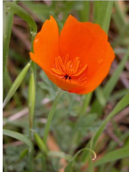
Eschscholzia californica California Poppy Native Perennial Papaveraceae