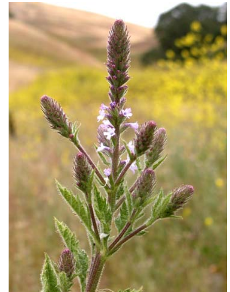
Verbena lasiostachys var. scabrada Robust Vervain Native Perennial Verbenaceae