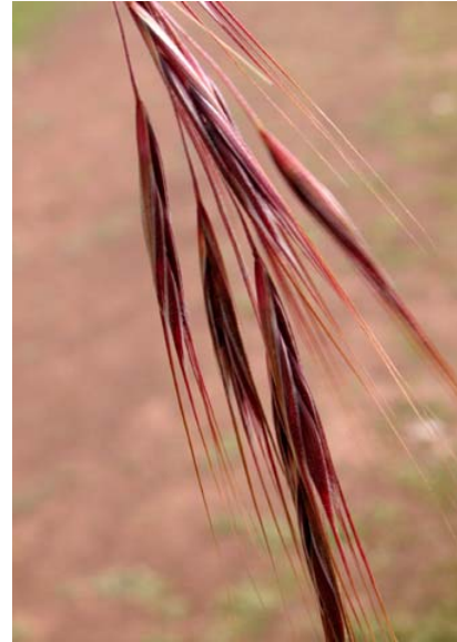
Bromus diandrus Ripgut Brome Introduced Annual Poaceae