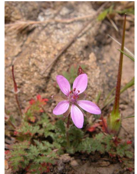
Erodium cicutarium Red-stem Filaree Introduced Annual Geraniaceae