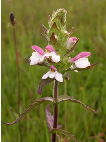
Bellardia trixago Bellardia Introduced Annual Scrophulariaceae