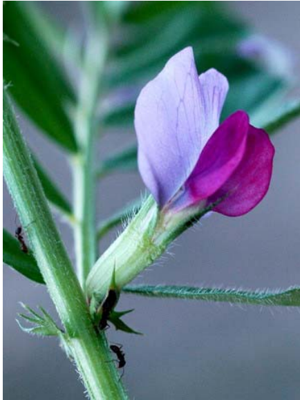
Vicia sativa ssp. sativa Spring Vetch Introduced Annual Fabaceae