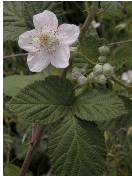
Rubus discolor Himalayan Blackberry Introduced Perennial Rosaceae