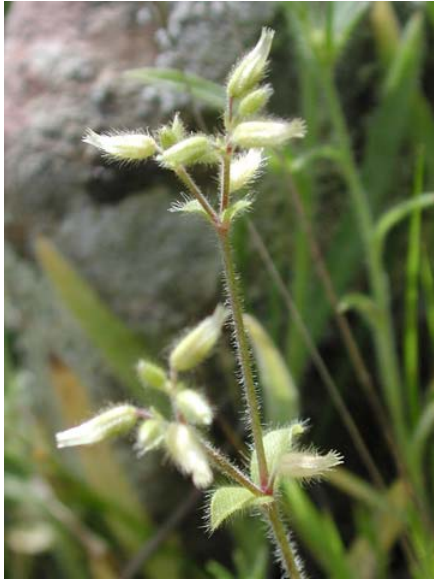
Cerastium glomeratum Mouse-ear Chickweed Introduced Annual Caryophyllaceae