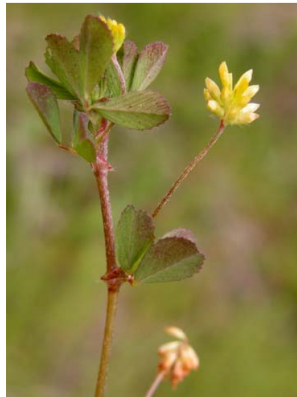
Trifolium dubium Shamrock Clover Introduced Annual Fabaceae