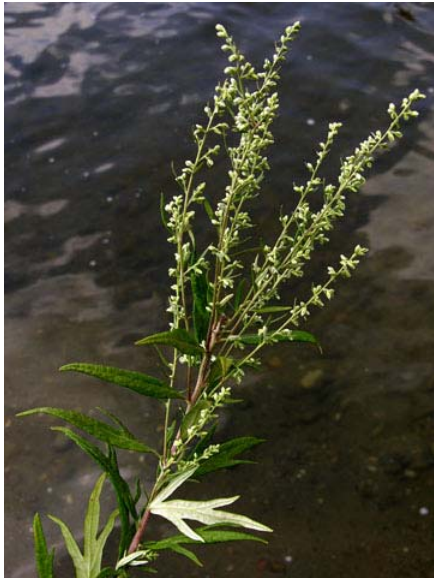
Artemisia douglasiana California Mugwort Native Perennial Asteraceae