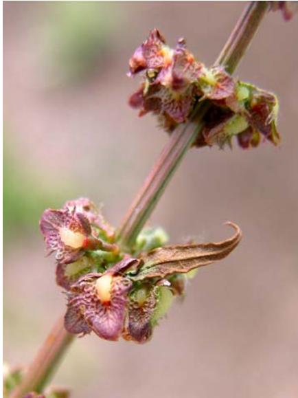
Rumex pulcher Fiddle Dock Introduced Perennial Polygonaceae