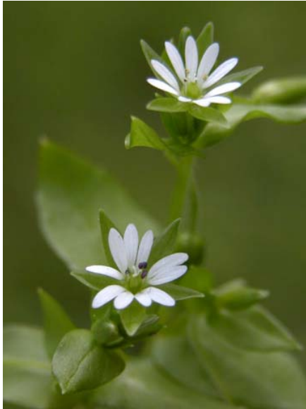
Stellaria media Common Chickweed Introduced Annual Caryophyllaceae