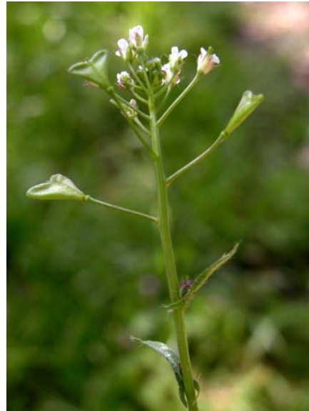
Capsella bursa-pastoris Shepherd's Purse Introduced Annual Brassicaceae