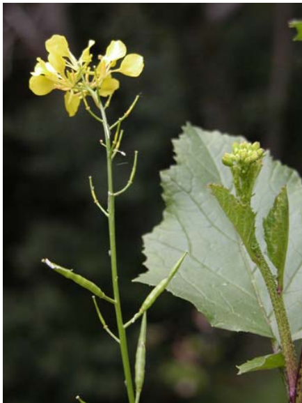
Sinapis arvensis Yellow Charlock Introduced Annual Brassicaceae