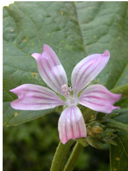
Malva nicaeensis Bull Mallow Introduced Annual Malvaceae