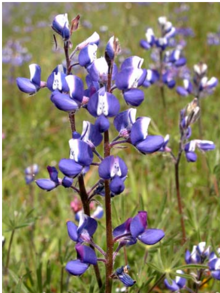
Lupinus bicolor Miniature Dove Lupine Native Annual Fabaceae