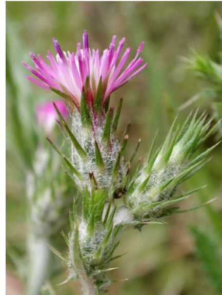
Carduus pycnocephalus Italian Thistle Introduced Annual Asteraceae