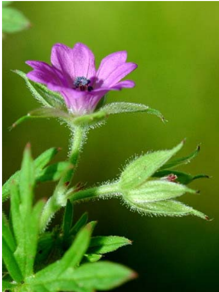
Geranium dissectum Purpletip Cut-leaf Geranium Introduced Annual Geraniaceae