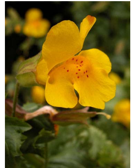
Mimulus guttatus Golden Monkey Flower Native Perennial Scrophulariaceae