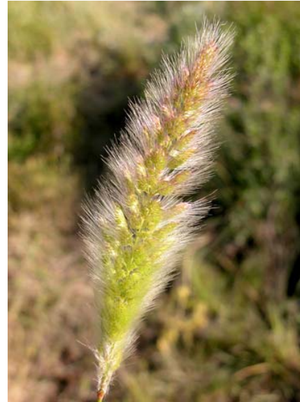
Polypogon monspeliensis Annual Rabbitfoot Grass Introduced Annual Poaceae