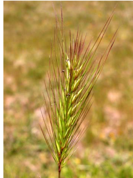
Hordeum marinum ssp. gussoneanum Mediterranean Barley Introduced Annual Poaceae