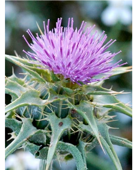
Silybum marianum Milk Thistle Introduced Annual-Biennial Asteraceae