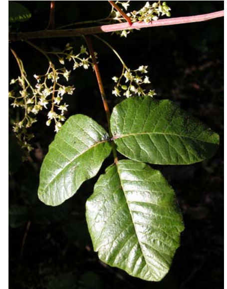
Toxicodendron diversilobum Poison Oak Native Perennial Anacardiaceae