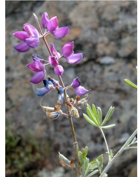
Lupinus albifrons var. collinus Bay Area Silver Lupine Native Perennial Fabaceae