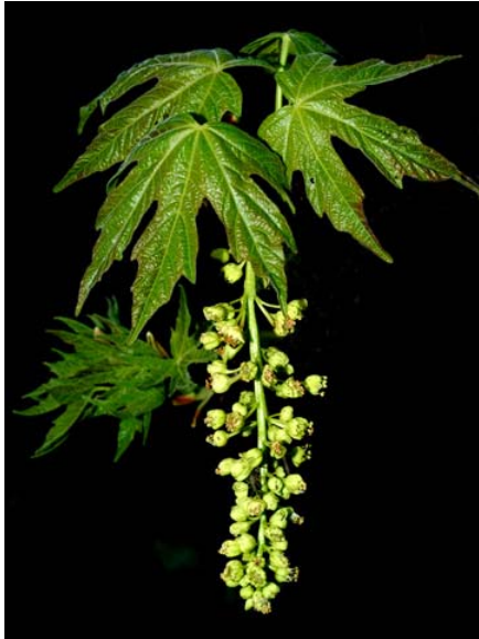
Acer macrophyllum Bigleaf Maple Native Perennial Aceraceae