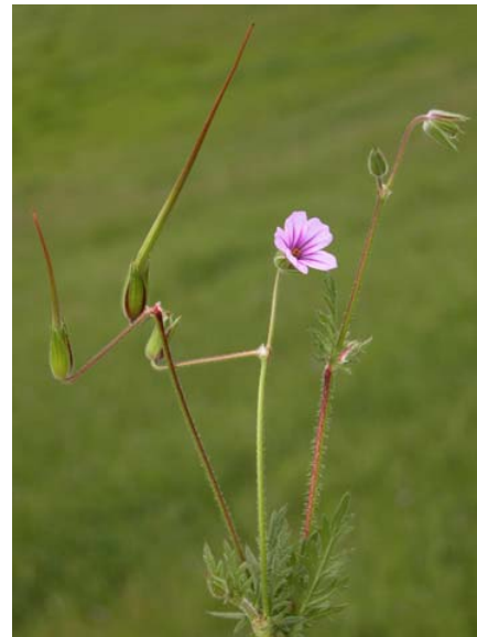
Erodium botrys Long-beaked Filaree Introduced Annual Geraniaceae