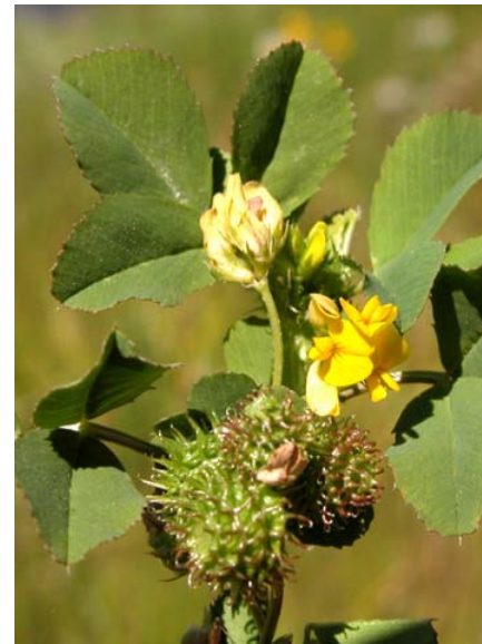
Medicago polymorpha California Bur Clover Introduced Annual Fabaceae