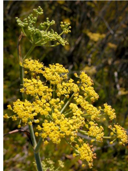
Foeniculum vulgare Sweet Fennel Introduced Perennial Apiaceae