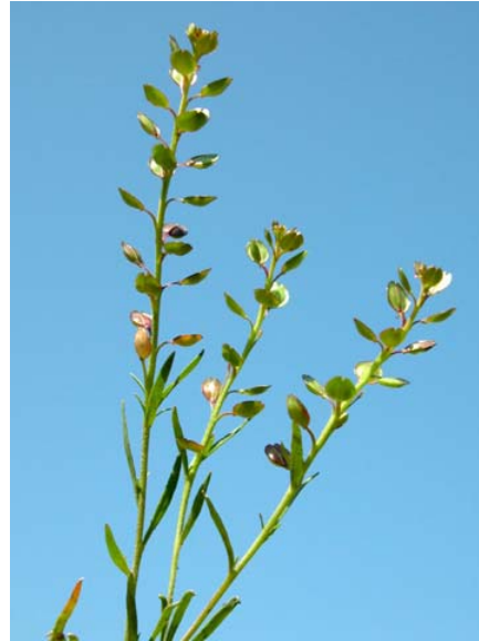
Lepidium nitidum var. nitidum Threadleaf Peppergrass Native Annual Brassicaceae