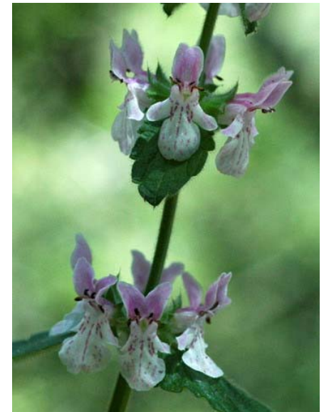
Stachys ajugoides var. rigida Common Rigid Hedge Nettle Native Perennial Lamiaceae