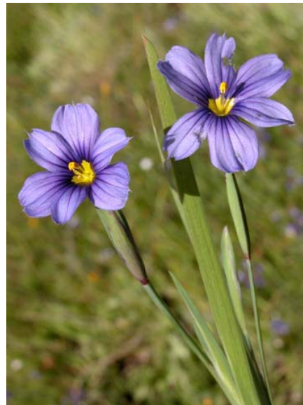
Sisyrinchium bellum Blue-eyed Grass Native Perennial Iridaceae