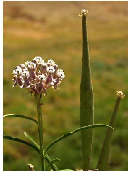
Asclepias fascicularis Whorled/Narrow-leaf Milkweed Native Perennial Asclepiadaceae