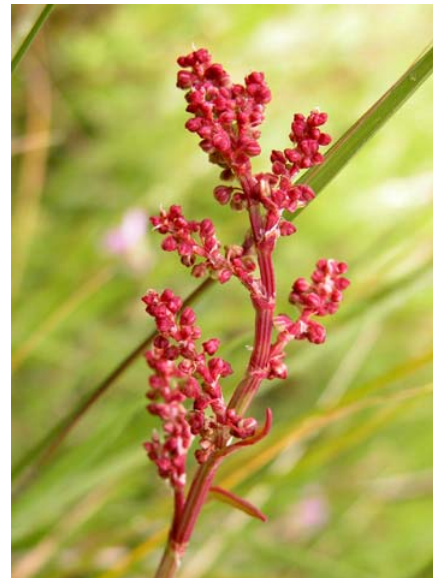
Rumex acetosella Sheep Sorrel Introduced Perennial Polygonaceae