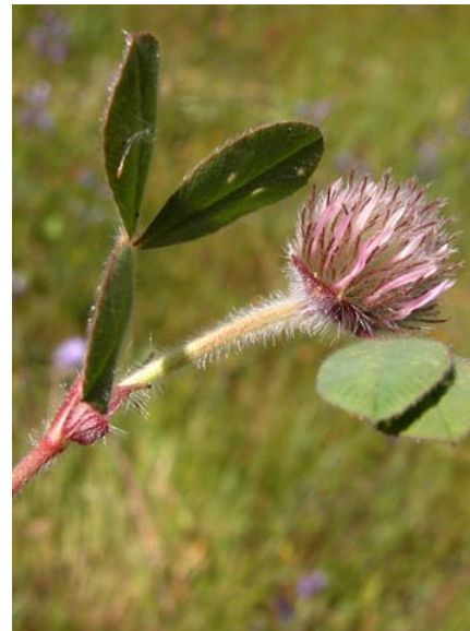
Trifolium hirtum Rose Clover Introduced Annual Fabaceae