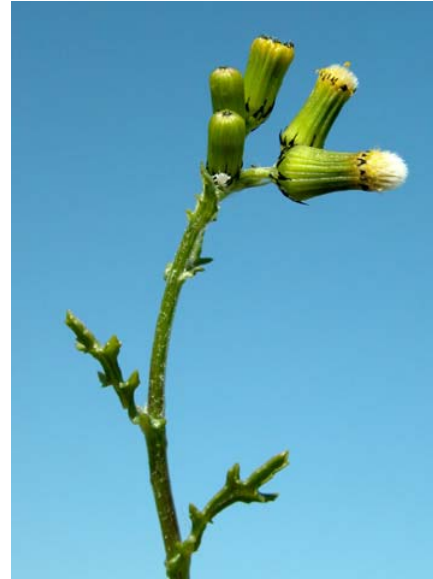
Senecio vulgaris Common Groundsel Introduced Annual Asteraceae