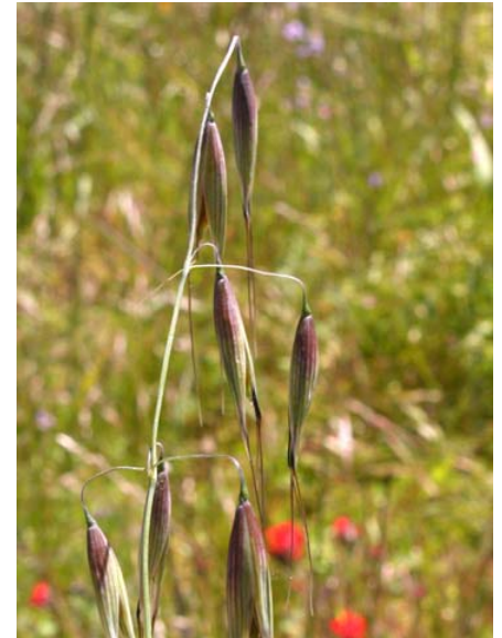
Avena fatua Wild Oat Introduced Annual Poaceae