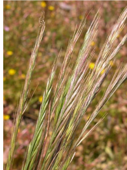
Vulpia bromoides Six-weeks Fescue Introduced Annual Poaceae