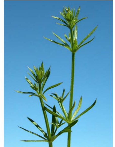
Galium aparine Goosegrass Bedstraw Native Annual Rubiaceae