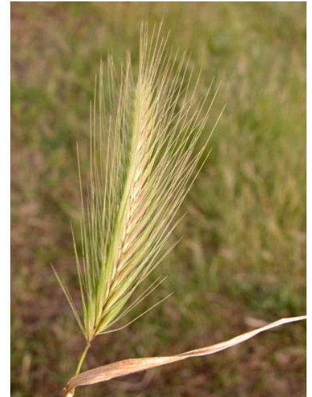
Hordeum murinum ssp. leporinum Hare Barley Introduced Annual Poaceae