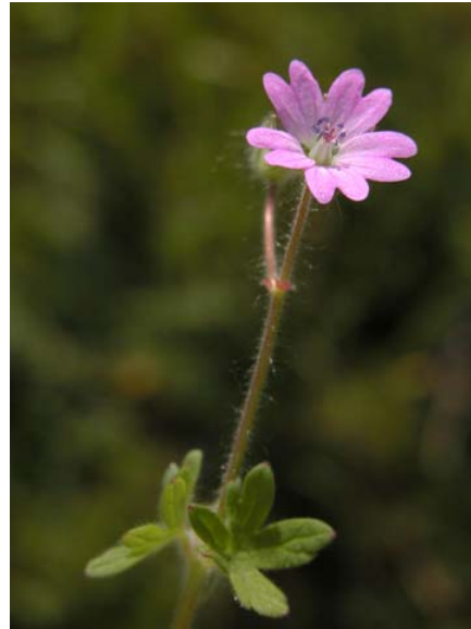
Geranium molle Hairy Dove's Foot Geranium Introduced Annual Geraniaceae