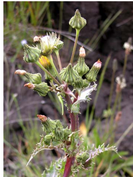
Sonchus asper ssp. asper Prickly Sow Thistle Introduced Annual Asteraceae