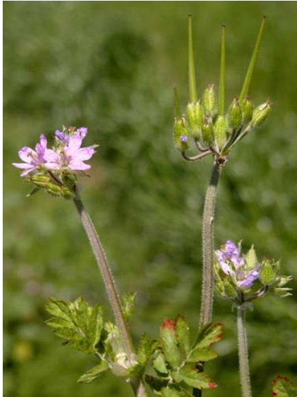
Erodium moschatum White-stem Filaree Introduced Annual Geraniaceae