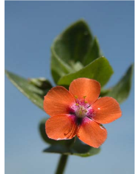
Anagallis arvensis Scarlet Pimpernel Introduced Annual Primulaceae