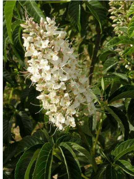
Aesculus californica California Buckeye Native Perennial Hippocastanaceae