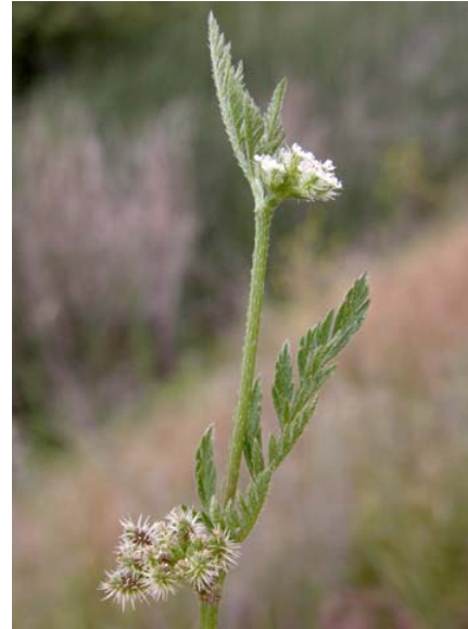
Torilis nodosa Knotted Hedge Parsley Introduced Annual Apiaceae