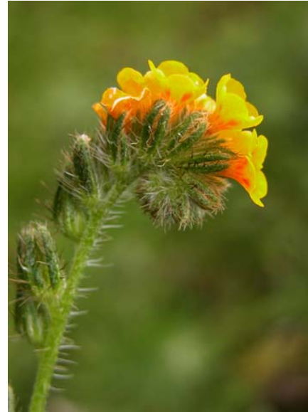
Amsinckia menziesii var. intermedia Common Fiddleneck Native Annual Boraginaceae