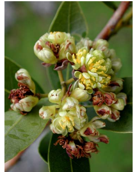
Umbellularia californica California Bay Laurel Native Perennial Lauraceae