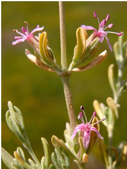
Frankenia salina Alkali Heath Native Perennial Frankeniaceae