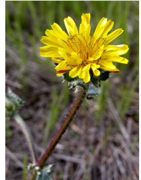
Picris echioides Bristly Ox-tongue Introduced Annual-Biennial Asteraceae