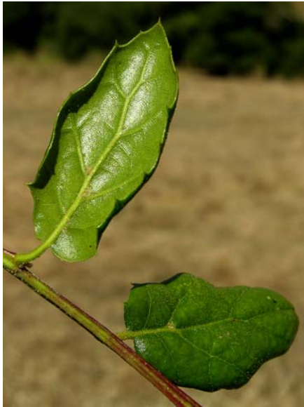
Quercus agrifolia var. agrifolia Coast Live Oak Native Perennial Fagaceae