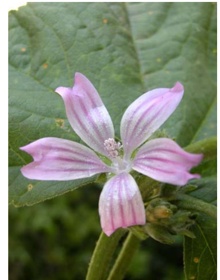
Malva nicaeensis Bull Mallow Introduced Annual Malvaceae