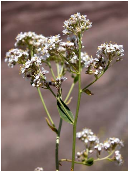
Lepidium latifolium Slender Peren. Peppergrass Introduced Perennial Brassicaceae