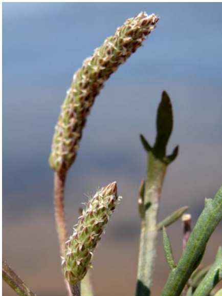
Plantago coronopus Cut-leaf Plantain Native Annual-Biennial Plantaginaceae