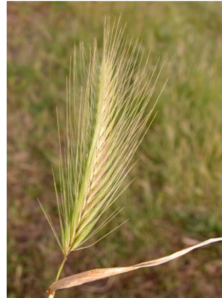
Hordeum murinum ssp. leporinum Hare Barley Introduced Annual Poaceae