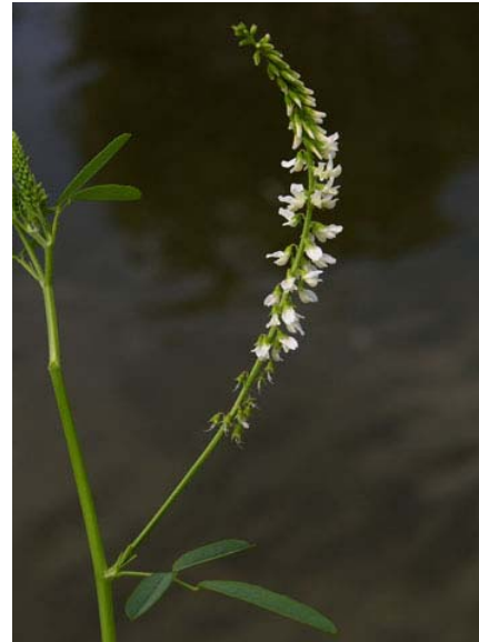
Melilotus alba White Sweet Clover Introduced Annual-Biennial Fabaceae