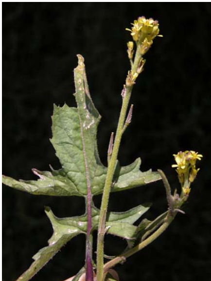
Brassica nigra Black Mustard Introduced Annual Brassicaceae