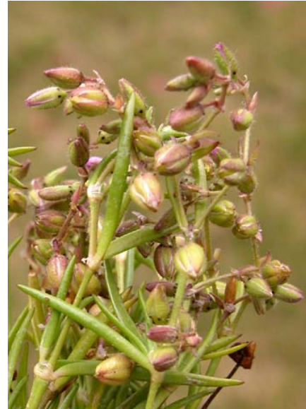
Spergularia marina Salt-marsh Sand Spurrey Native Annual Caryophyllaceae