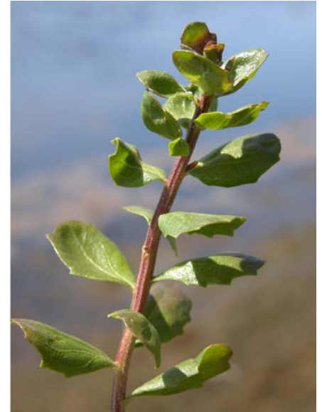
Baccharis pilularis Coyote Bush Native Perennial Asteraceae