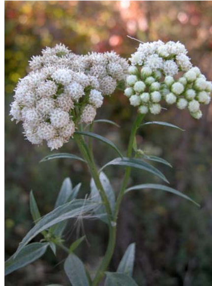
Baccharis douglasii Douglas/Salt Marsh Baccharis Native Perennial Asteraceae