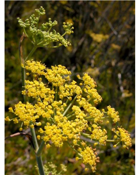
Foeniculum vulgare Sweet Fennel Introduced Perennial Apiaceae