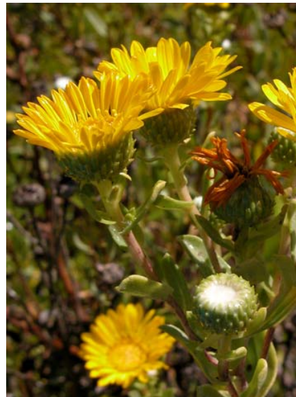
Grindelia stricta var. angustifolia Narrowleaf Pacific Gumplant Native Perennial Asteraceae