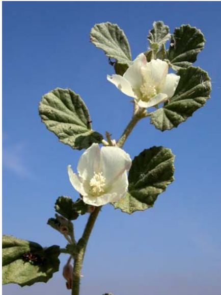
Malvella leprosa Alkali Mallow Native Perennial Malvaceae