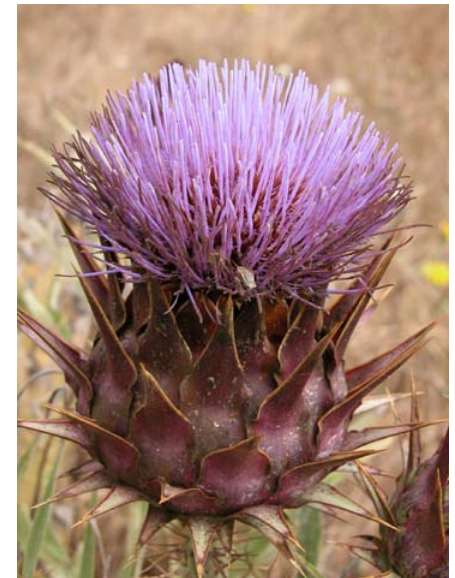
Cynara cardunculus Cardoon / Artichoke Thistle Introduced Perennial Asteraceae