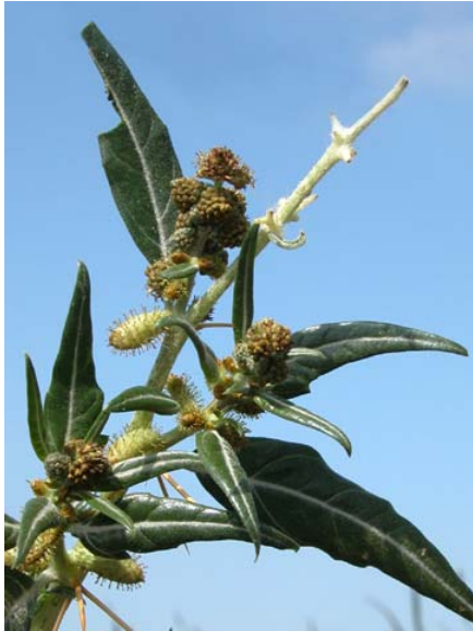
Xanthium spinosum Spiny Crotbur Native Annual Asteraceae