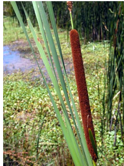
Typha angustifolia Narrow-leaf Cattail Native Perennial Typhaceae