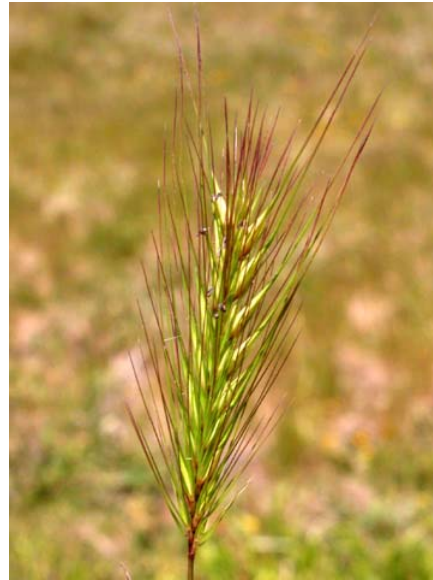
Hordeum marinum ssp. gussoneanum Mediterranean Barley Introduced Annual Poaceae