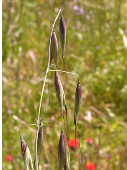
Avena fatua Wild Oat Introduced Annual Poaceae