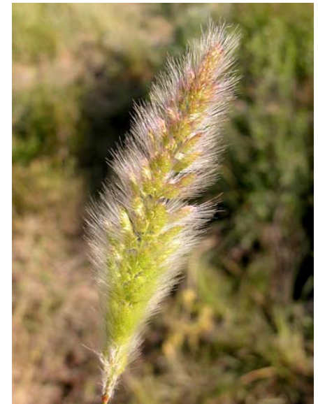
Polypogon monspeliensis Annual Rabbitfoot Grass Introduced Annual Poaceae