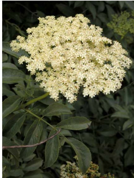
Sambucus mexicana Blue Elderberry Native Perennial Caprifoliaceae