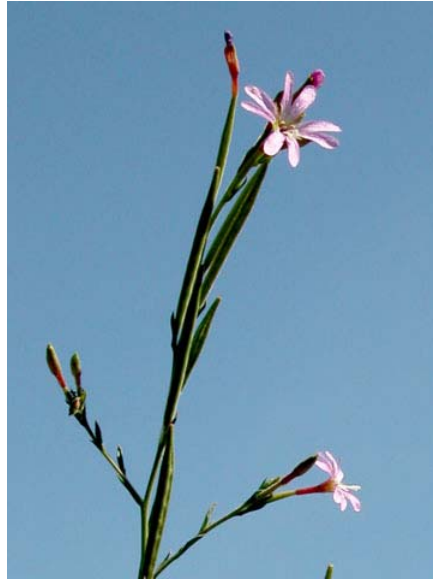
Epilobium brachycarpum Panicked / Weedy Willowherb Native Annual Onagraceae