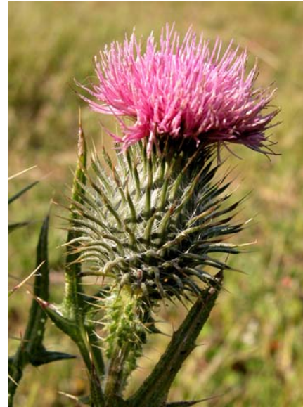
Cirsium vulgare Bull Thistle Introduced Biennial Asteraceae