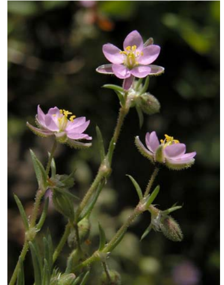
Spergularia rubra Ruby Sand Spurry Introduced Annual-Perennial Caryophyllaceae