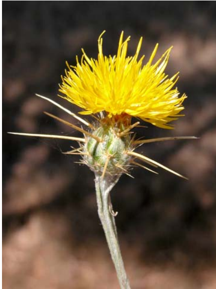
Centaurea solstitialis Yellow Star Thistle Introduced Annual Asteraceae