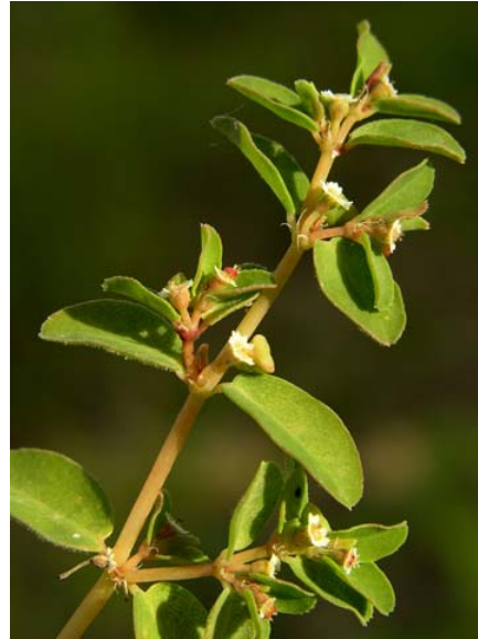
Chamaesyce serpyllifolia ssp. serpyllifolia Thymeleaf Spurge Native Annual Euphorbiaceae