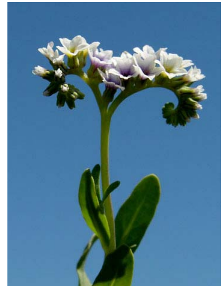
Heliotropium curassavicum Seaside Heliotrope Native Perennial Boraginaceae