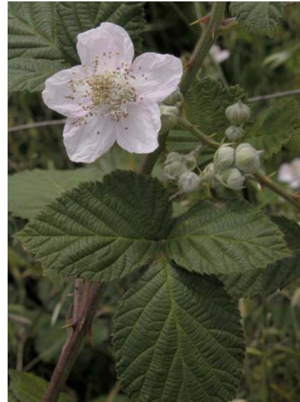
Rubus discolor Himalayan Blackberry Introduced Perennial Rosaceae