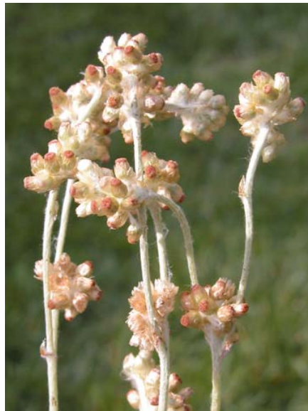
Gnaphalium luteo-album Weedy Cudweed Introduced Annual Asteraceae