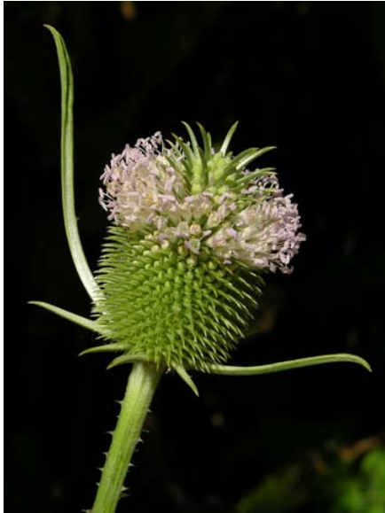
Dipsacus sativus Wild Teasel Introduced Biennial Dipsacaceae