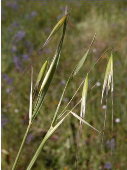
Avena barbata Slender Wild Oat Introduced Annual Poaceae