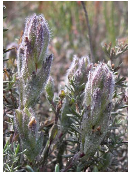
Cordylanthus mollis ssp. mollis Soft Bird's Beak Native Annual Scrophulariaceae