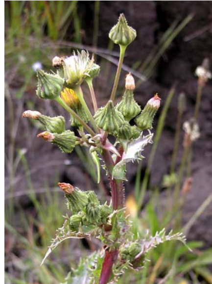
Sonchus asper ssp. asper Prickly Sow Thistle Introduced Annual Asteraceae