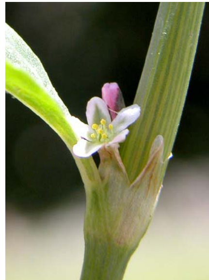
Polygonum arenastrum Common Yard Knotweed Introduced Annual Polygonaceae