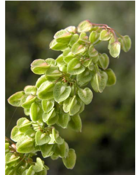
Rumex crispus Curly Dock Introduced Perennial Polygonaceae