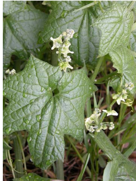
Marah fabaceus Common / California Manroot Native Perennial Cucurbitaceae