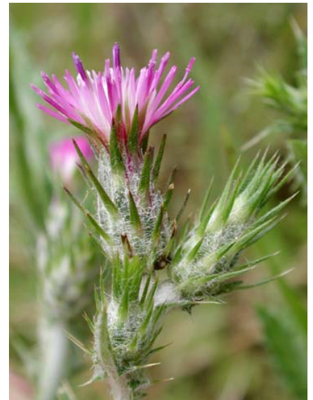
Carduus pycnocephalus Italian Thistle Introduced Annual Asteraceae