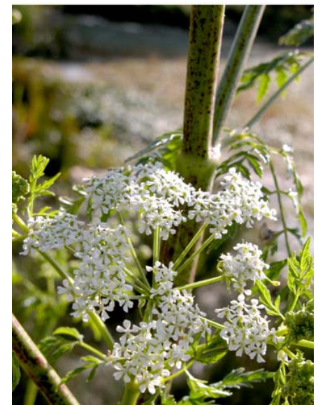
Conium maculatum Poison Hemlock Introduced Biennial Apiaceae