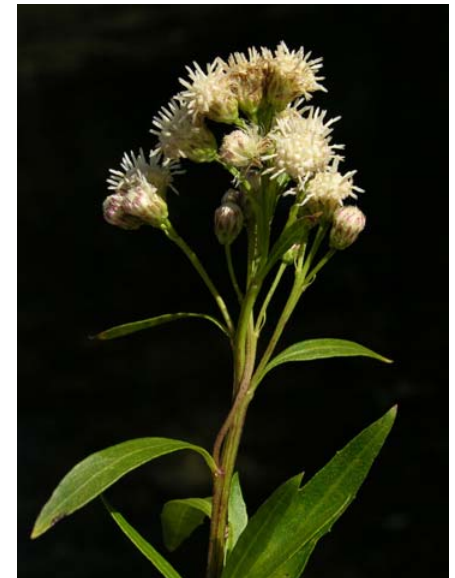
Baccharis salicifolia Mulefat Native Perennial Asteraceae