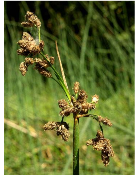
Scirpus acutus var. occidentalis Hardstem Bulrush Native Perennial Cyperaceae