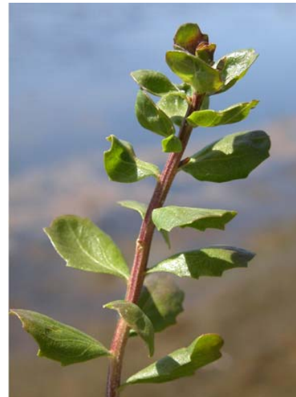
Baccharis pilularis Coyote Bush Native Perennial Asteraceae