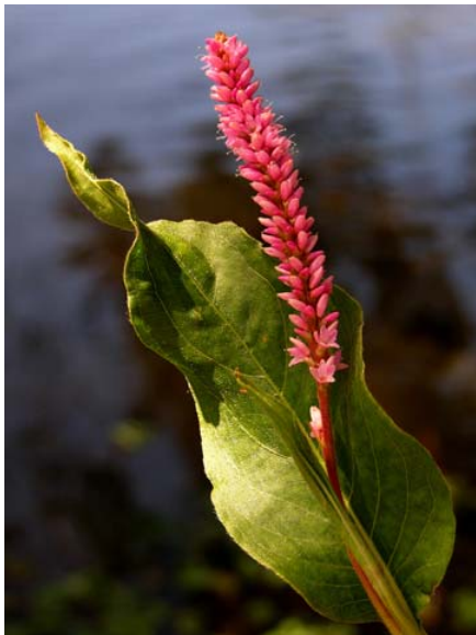
Polygonum amphibium var. emersum Swamp / Water Knotweed Native Perennial Polygonaceae