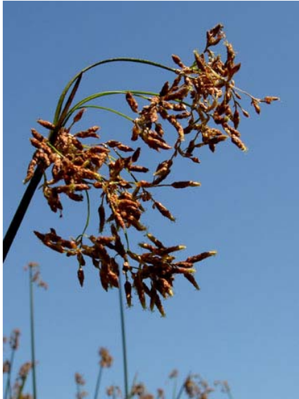
Scirpus californicus California Bulrush Native Perennial Cyperaceae