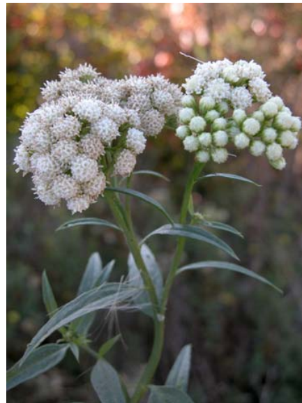
Baccharis douglasii Douglas/Salt Marsh Baccharis Native Perennial Asteraceae