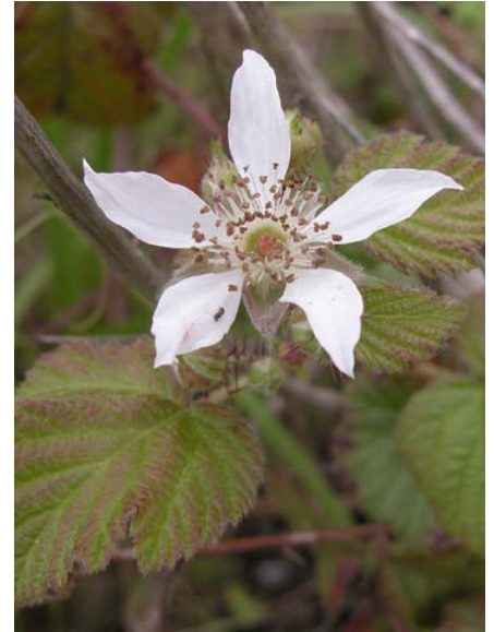
Rubus ursinus Native California Blackberry Native Perennial Rosaceae