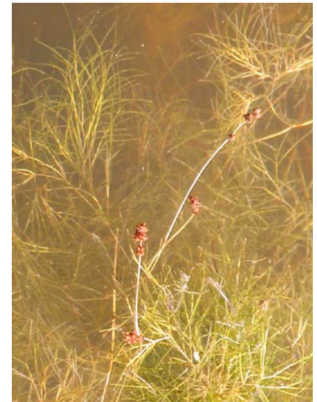
Potamogeton pectinatus Fennel-leaf Pondweed Native Perennial Potamogetonaceae