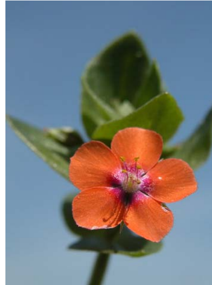
Anagallis arvensis Scarlet Pimpernel Introduced Annual Primulaceae