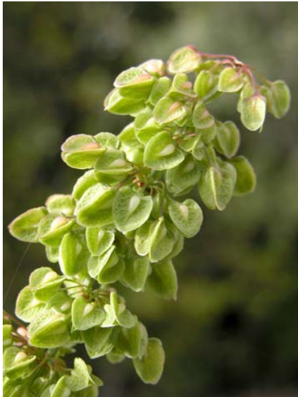
Rumex crispus Curly Dock Introduced Perennial Polygonaceae