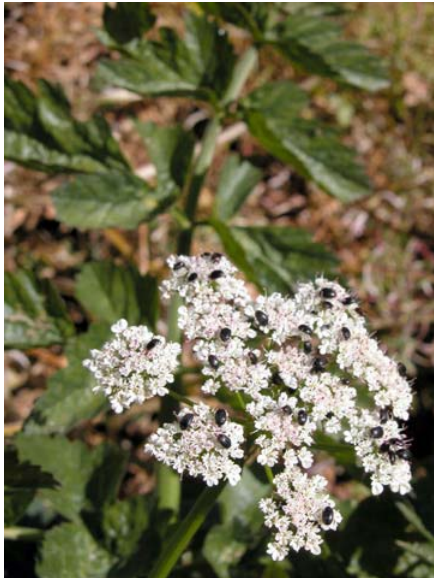
Oenanthe sarmentosa Pacific Water Parsley Native Perennial Apiaceae