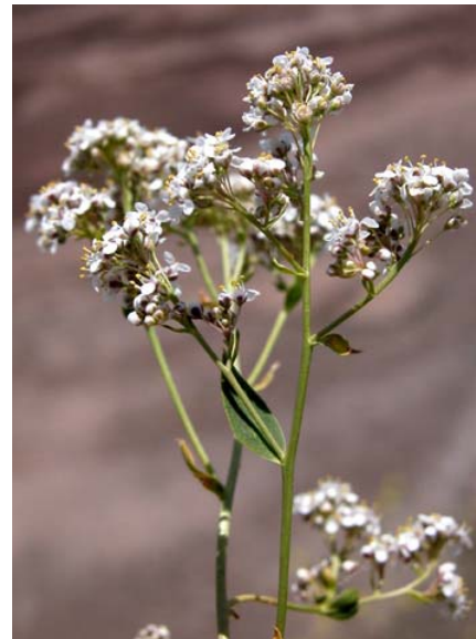
Lepidium latifolium Slender Peren. Peppergrass Introduced Perennial Brassicaceae