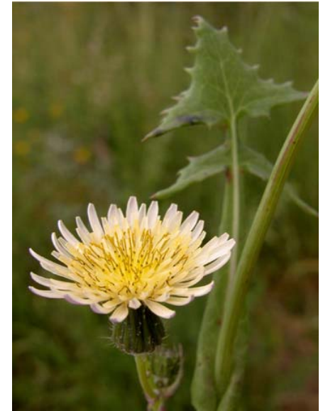
Sonchus oleraceus Common Sow Thistle Introduced Annual Asteraceae