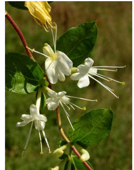
Lonicera japonica Japanese Honeysuckle Introduced Perennial Caprifoliaceae