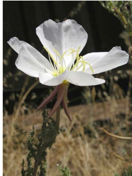
Oenothera deltooides ssp. howellii Antioch Dunes Eve Primrose Native Perennial Onagraceae