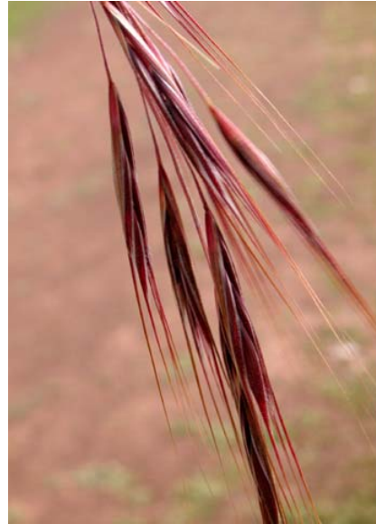
Bromus diandrus Ripgut Brome Introduced Annual Poaceae