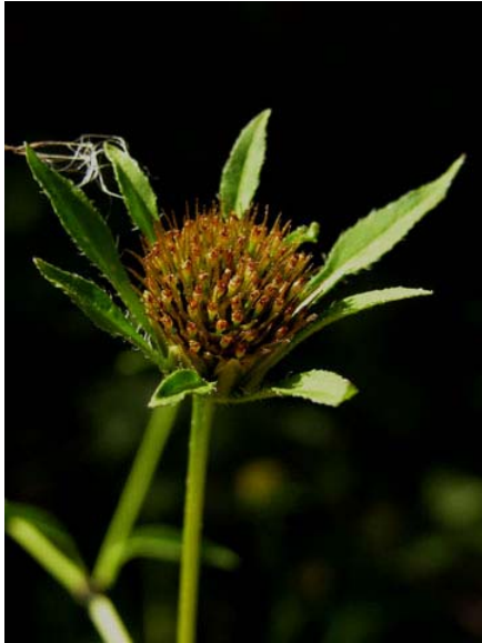
Bidens frondosa Sticktight Native Annual Asteraceae