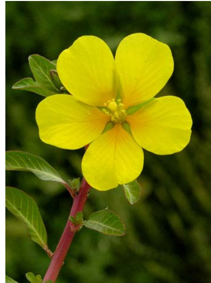
Ludwigia peploides ssp. peploides Yellow Water Primrose Native Perennial Onagraceae