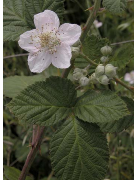
Rubus discolor Himalayan Blackberry Introduced Perennial Rosaceae