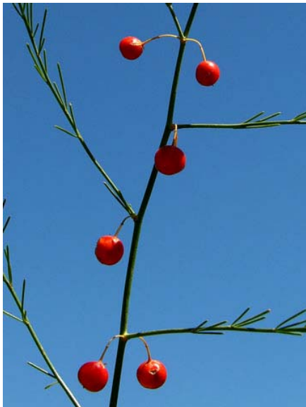
Asparagus officinalis ssp. officinalis Garden Asparagus Introduced Perennial Liliaceae