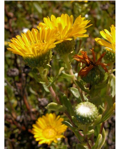
Grindelia stricta var. angustifolia Narrowleaf Pacific Gumplant Native Perennial Asteraceae