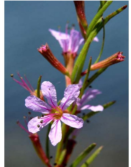
Lythrum californicum California Loosestrife Native Perennial Lythraceae