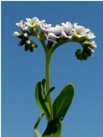
Heliotropium curassavicum Seaside Heliotrope Native Perennial Boraginaceae