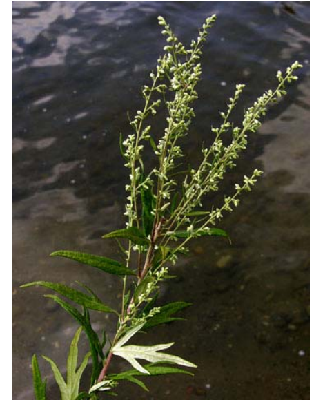
Artemisia douglasiana California Mugwort Native Perennial Asteraceae