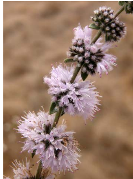
Mentha pulegium Pennyroyal Introduced Perennial Lamiaceae