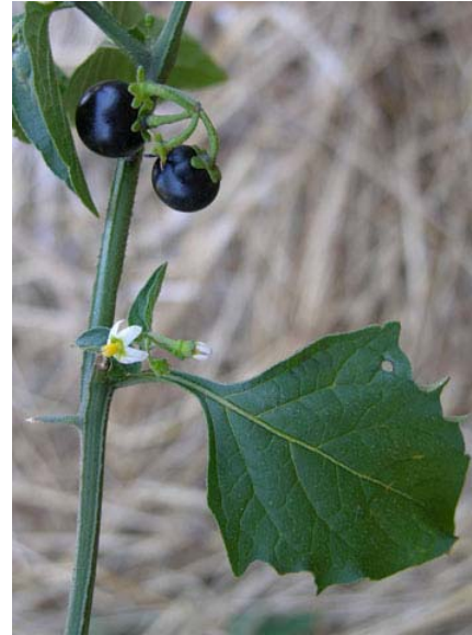
Solanum americanum Small-flower Nightshade Native Annual-Perennial Solanaceae