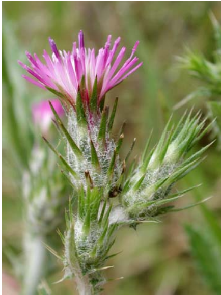
Carduus pycnocephalus Italian Thistle Introduced Annual Asteraceae