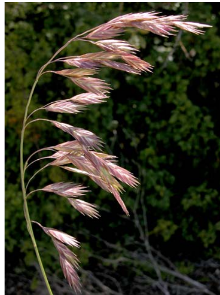
Bromus catharticus Rescue Brome Introduced Annual-Perennial Poaceae