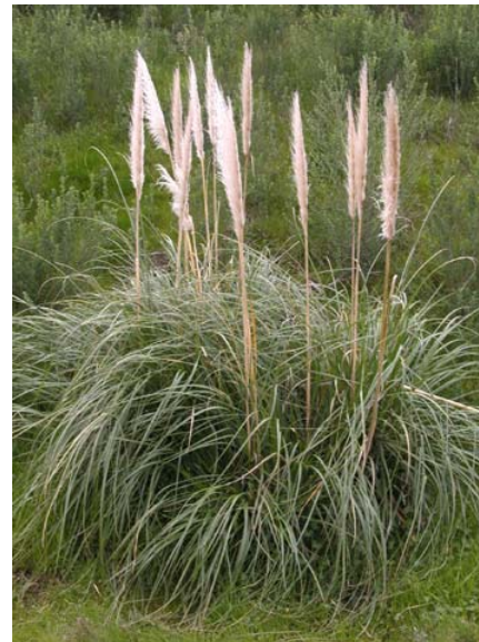
Cortaderia selloana Smooth Pampas Grass Introduced Perennial Poaceae