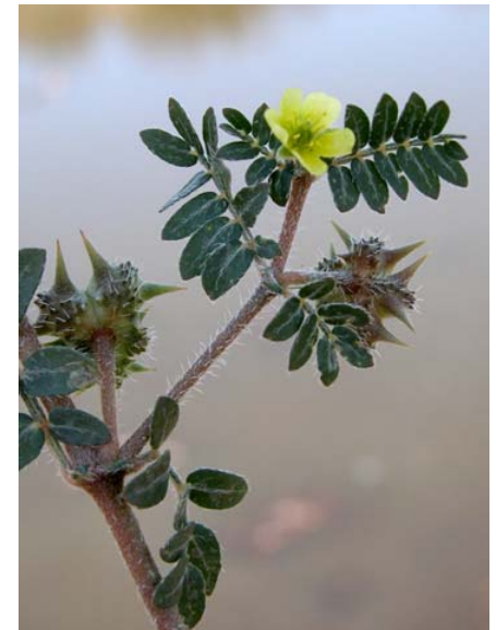
Tribulus terrestris Puncture Vine Introduced Annual Zygophyllaceae