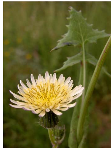
Sonchus oleraceus Common Sow Thistle Introduced Annual Asteraceae