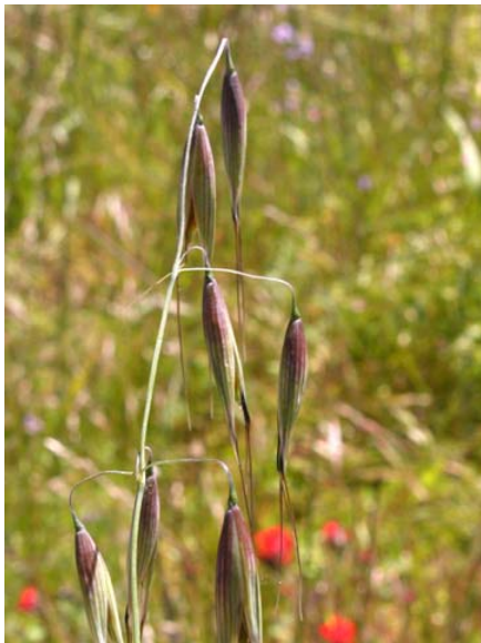
Avena fatua Wild Oat Introduced Annual Poaceae