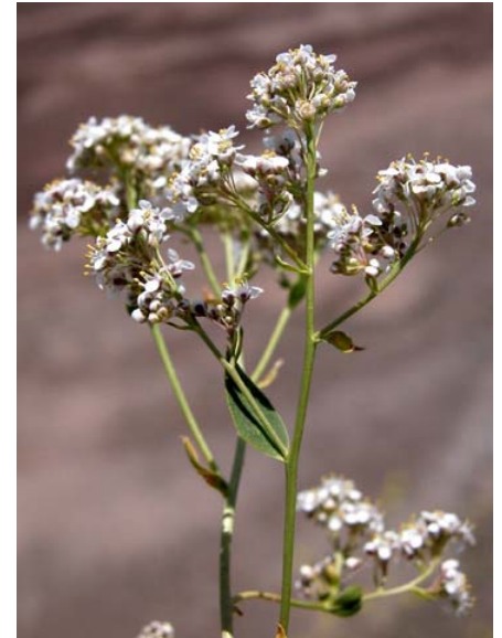
Lepidium latifolium Slender Peren. Peppergrass Introduced Perennial Brassicaceae