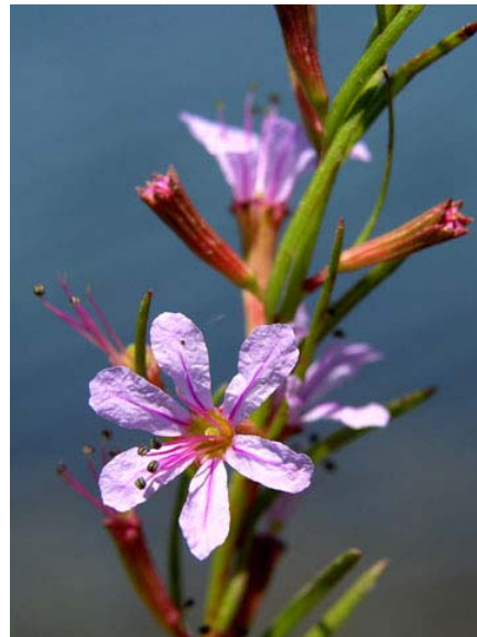
Lythrum californicum California Loosestrife Native Perennial Lythraceae