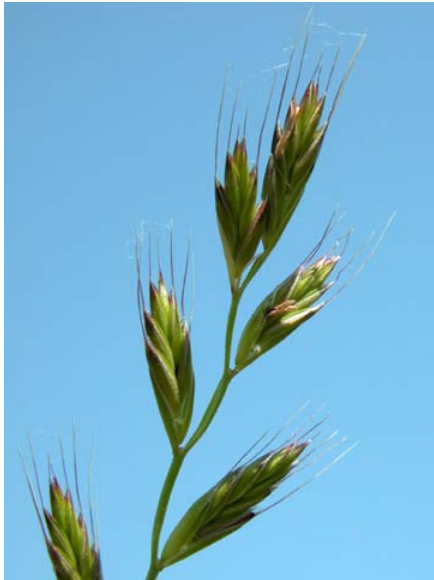
Lolium multiflorum Awned Italian Rye Grass Introduced Perennial Poaceae