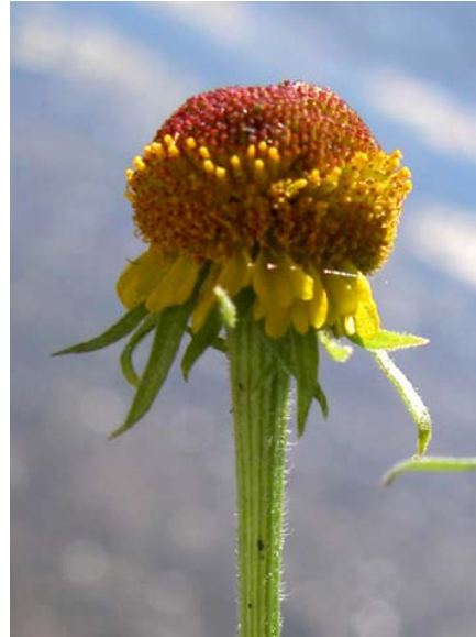
Helenium puberulum Rosilla Native Biennial Asteraceae