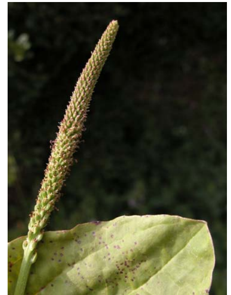
Plantago major Common Plantain Introduced Annual-Perennial Plantaginaceae