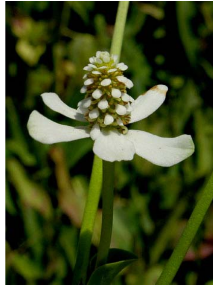
Anemopsis californica Yerba Mansa Native Perennial Saururaceae