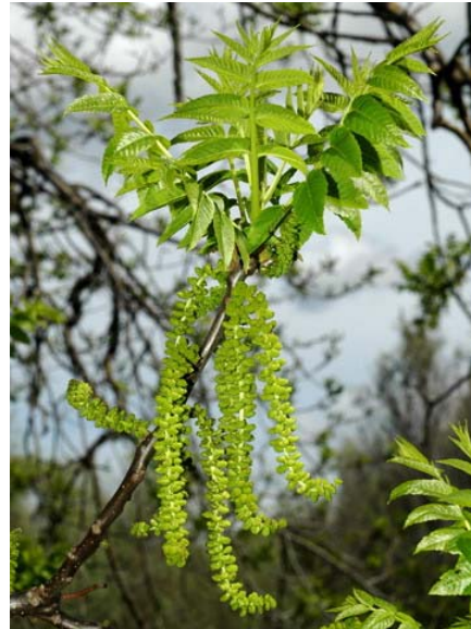
Juglans californica var. hindsii N. California Black Walnut Native Perennial Juglandaceae