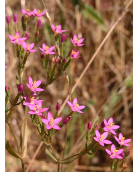
Centaurium muhlenbergii Monterey Centaury Native Annual-Biennial Gentianaceae