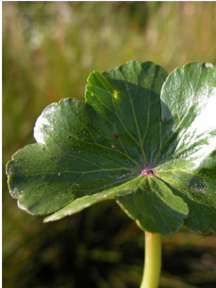
Hydrocotyle ranunculoides Water Pennywort Native Perennial Apiaceae