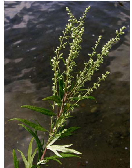
Artemisia douglasiana California Mugwort Native Perennial Asteraceae