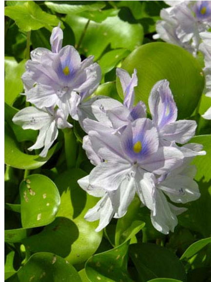
Eichhornia crassipes Water Hyacinth Introduced Perennial Pontederiaceae