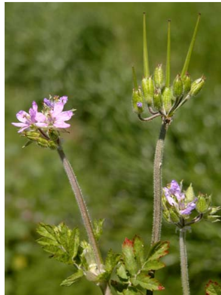
Erodium moschatum White-stem Filaree Introduced Annual Geraniaceae