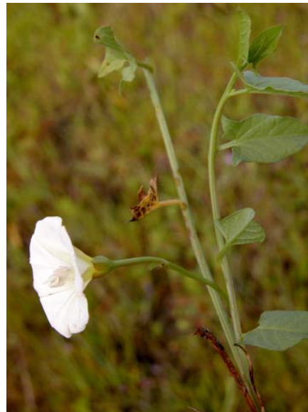
Convolvulus arvensis Field Bindweed Introduced Perennial Convolvulaceae