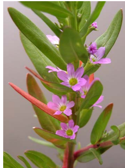
Lythrum hyssopifolium Grass Poly Loosestrife Introduced Annual-Perennial Lythraceae