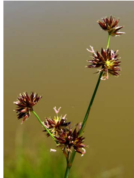
Juncus xiphioides Iris-leaf Rush Native Perennial Juncaceae