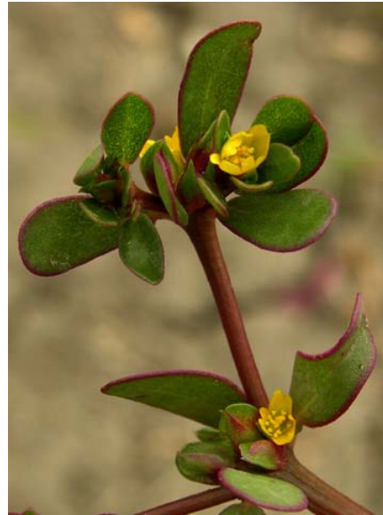
Portulaca oleracea Common Purslane Introduced Perennial Portulacaceae