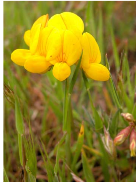
Lotus corniculatus Bird's-foot Deerweed Introduced Perennial Fabaceae