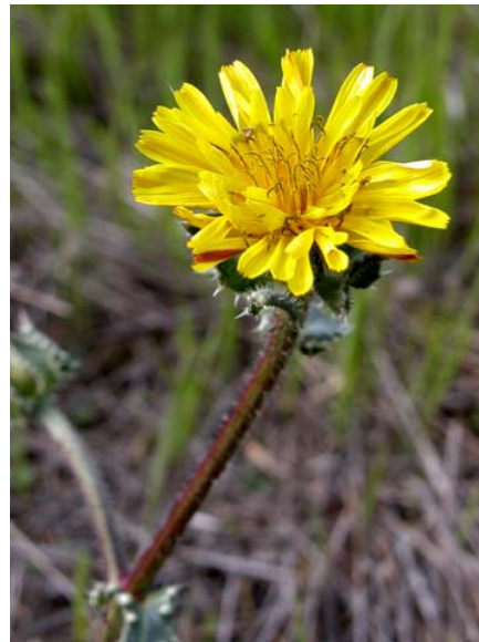
Picris echioides Bristly Ox-tongue Introduced Annual-Biennial Asteraceae