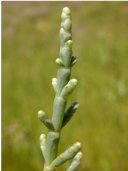
Salicornia virginica Virginia Pickleweed Native Perennial Chenopodiaceae