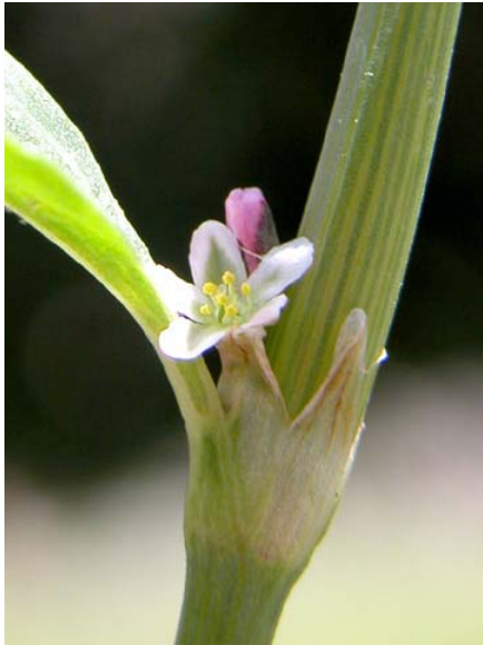
Polygonum arenastrum Common Yard Knotweed Introduced Annual Polygonaceae