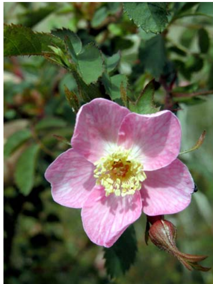
Rosa californica California Wild Rose Native Perennial Rosaceae