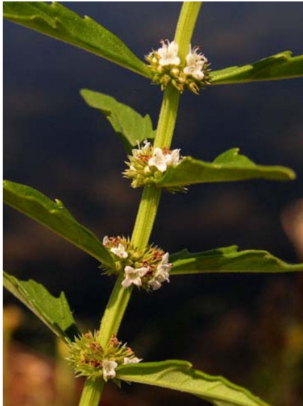
Mentha arvensis Field Mint Native Perennial Lamiaceae