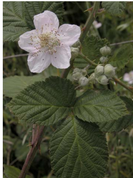
Rubus discolor Himalayan Blackberry Introduced Perennial Rosaceae