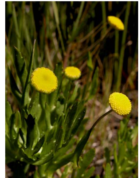
Cotula coronopifolia Brass Buttons Introduced Perennial Asteraceae