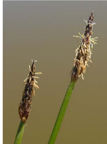
Eleocharis macrostachya Common Spikerush Native Perennial Cyperaceae