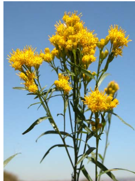
Euthamia occidentalis Western Goldenrod Native Perennial Asteraceae