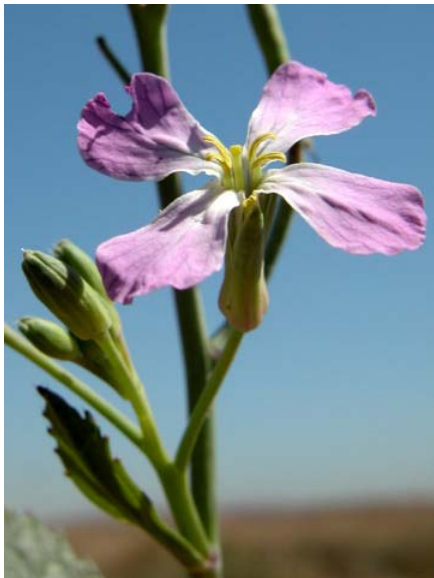
Raphanus sativus Wild Radish Introduced Annual Brassicaceae