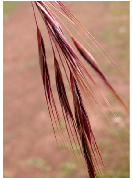
Bromus diandrus Ripgut Brome Introduced Annual Poaceae