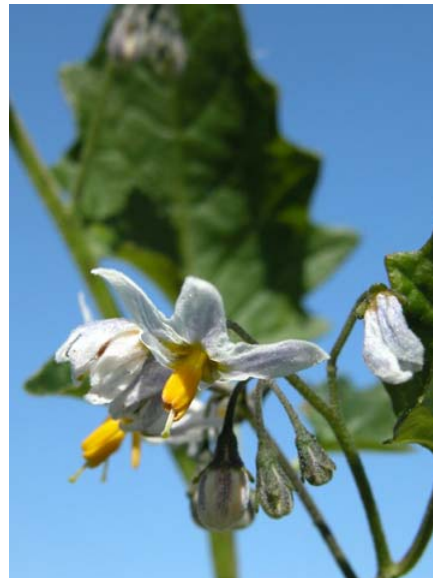
Solanum nigrum Black Nightshade Introduced Annual Solanaceae