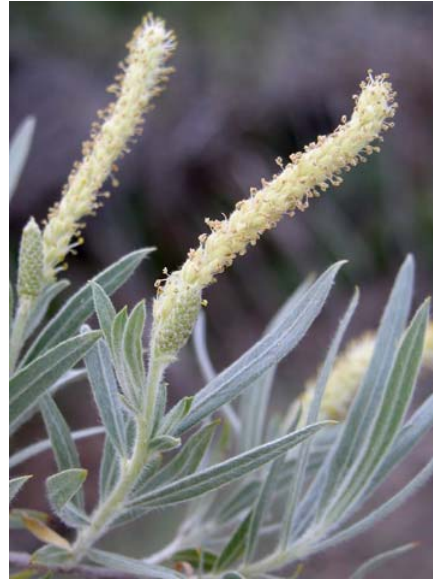
Salix exigua Narrowleaf Willow Native Perennial Salicaceae