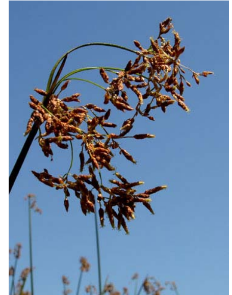
Scirpus californicus California Bulrush Native Perennial Cyperaceae