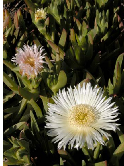
Carpobrotus edulis Yellow Hottentot Fig Introduced Perennial Aizoaceae