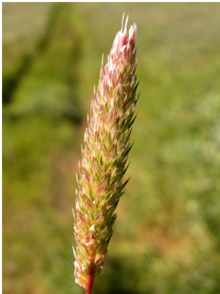
Phalaris aquatica Harding Grass Introduced Perennial Poaceae