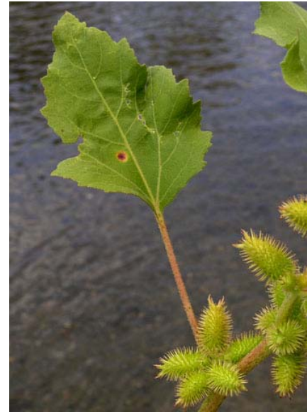
Xanthium strumarium Cocklebur Native Annual Asteraceae