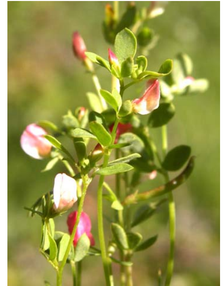
Lotus purshianus var. purshianus Spanish Clover Native Annual Fabaceae