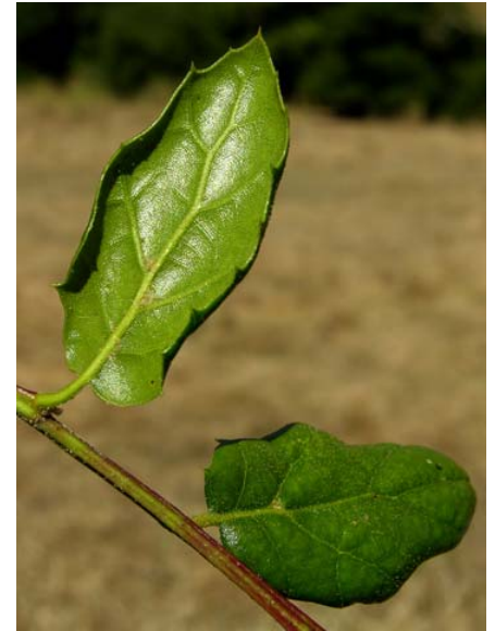
Quercus agrifolia var. agrifolia Coast Live Oak Native Perennial Fagaceae