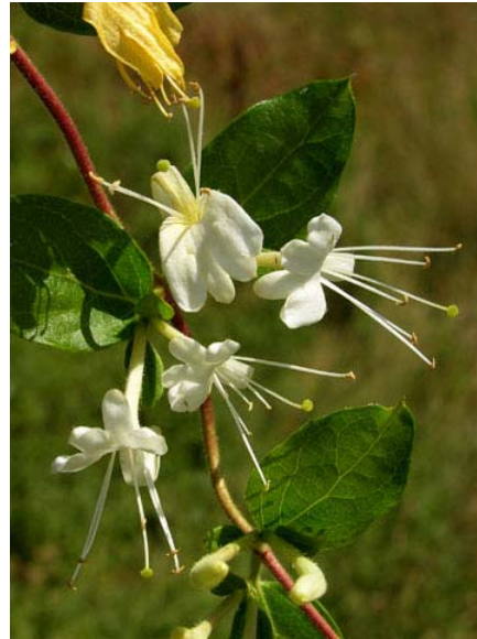
Lonicera japonica Japanese Honeysuckle Introduced Perennial Caprifoliaceae