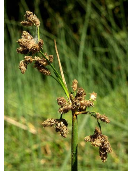
Scirpus acutus var. occidentalis Hardstem Bulrush Native Perennial Cyperaceae