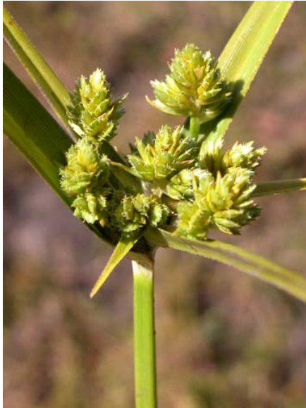
Cyperus eragrostis Tall Nutsedge Native Perennial Cyperaceae