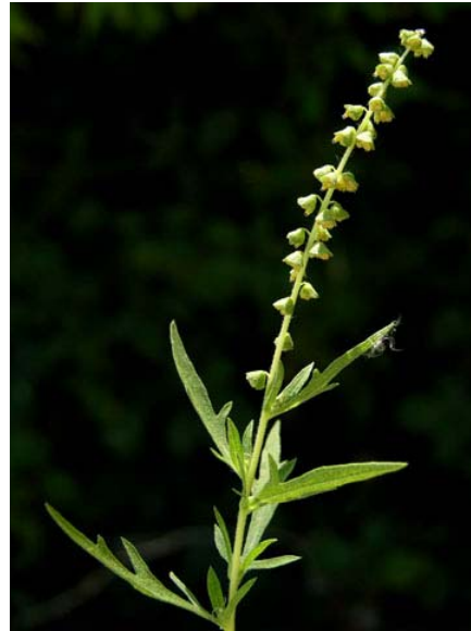
Ambrosia psilostachya Western Ragweed Native Perennial Asteraceae