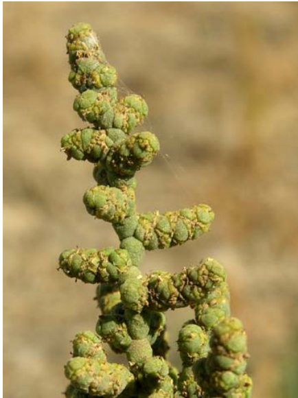
Allenrolfea occidentalis Iodine Bush Native Perennial Chenopodiaceae