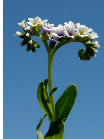
Heliotropium curassavicum Seaside Heliotrope Native Perennial Boraginaceae