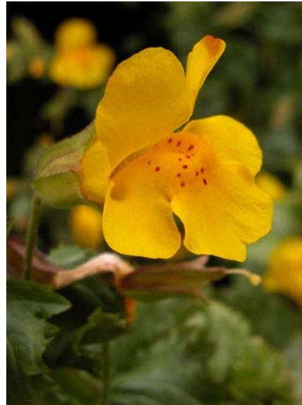
Mimulus guttatus Golden Monkey Flower Native Perennial Scrophulariaceae