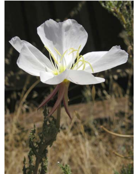
Oenothera deltoides ssp. howellii Antioch Dunes Eve Primrose Native Perennial Onagraceae