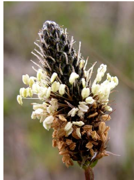
Plantago lanceolata English Plantain Introduced Annual Plantaginaceae