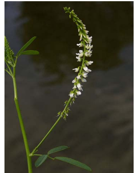
Melilotus alba White Sweet Clover Introduced Annual-Biennial Fabaceae