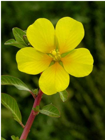
Ludwigia peploides ssp. peploides Yellow Water Primrose Native Perennial Onagraceae