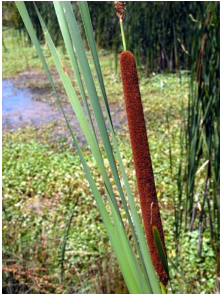
Typha angustifolia Narrow-leaf Cattail Native Perennial Typhaceae