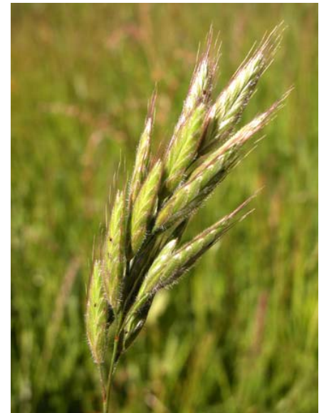
Bromus hordeaceus Soft Brome Introduced Annual Poaceae