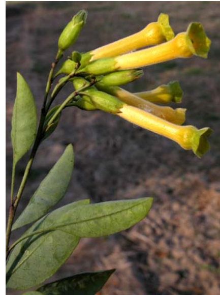
Nicotiana glauca Tree Tobacco Introduced Perennial Solanaceae