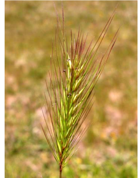
Hordeum marinum ssp. gussoneanum Mediterranean Barley Introduced Annual Poaceae