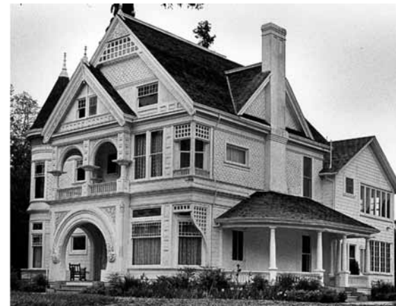
Ardenwood was named after a forest area described in Shakespeare's play "As You Like It."

A tremendous community and Park District effort has brought the farm to this point, but it is far from complete. We are busy restoring antique pieces of farm equipment and adding some things that weren't here 100 years ago. So don't make this your only visit! Come back soon to see how things are coming along.